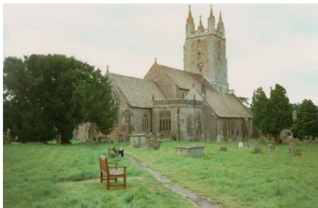
All Saints, Newland