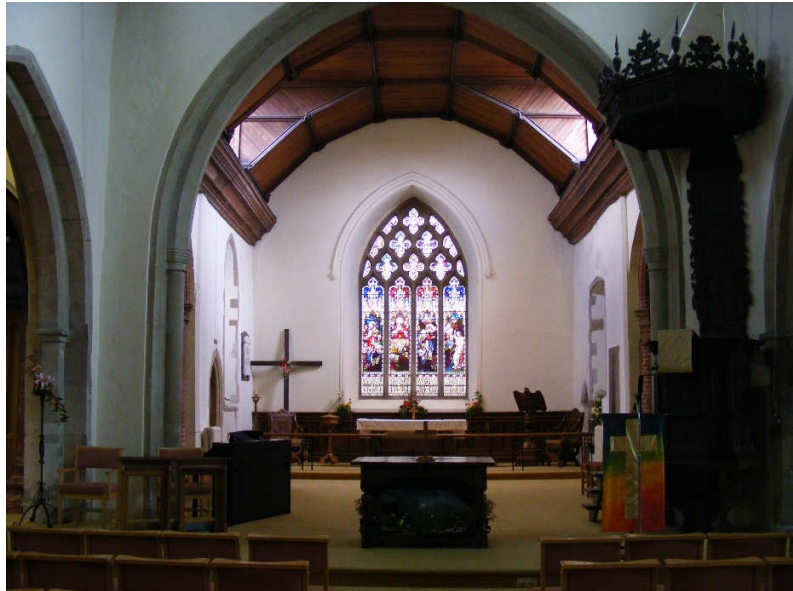
St Mary the Virgin, Great Baddow