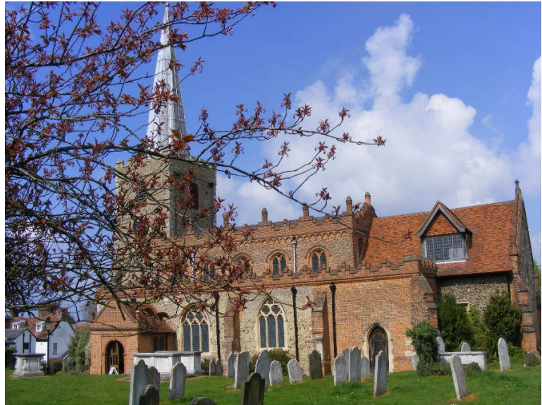
St. Mary the Virgin, Great Baddow