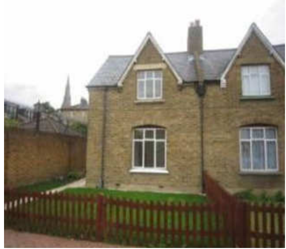
6 St. John's Cottages in 2010