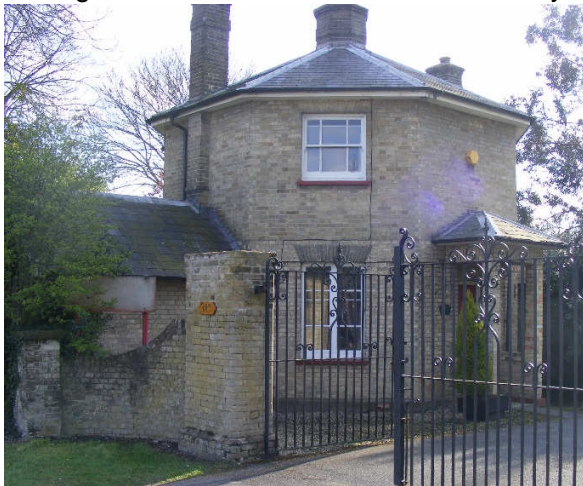
Broomfield Place Lodge