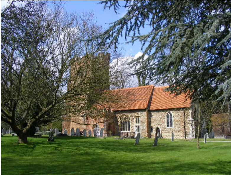
St. Andrew's, Sandon