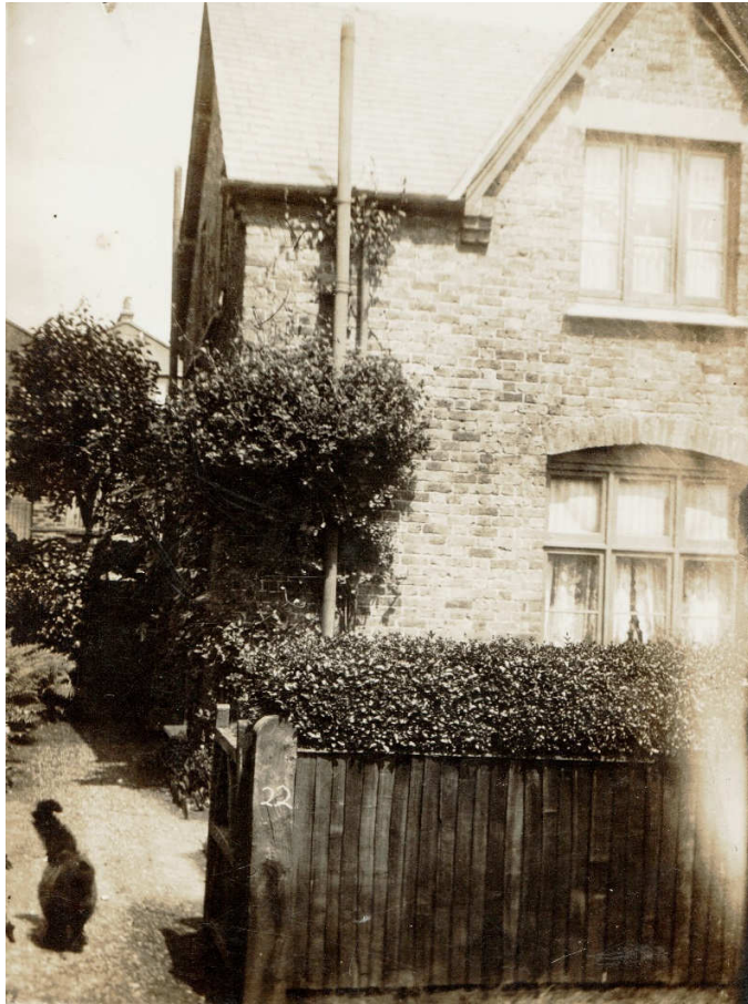
6 St. John's Cottage (despite the number 22)